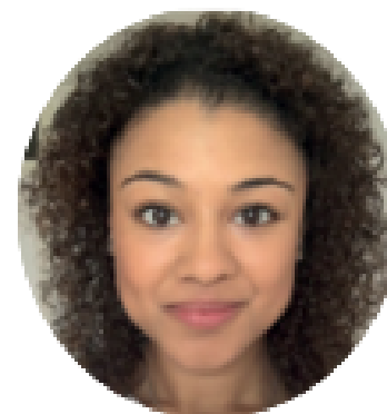
Essex & Thames ECT

"One of the best things about training with Essex and Thames is that everyone supported each other and shared advice and resources and stories. Being part of the 'SCITT family' is amazing. There are lots of teachers in our schools who were trained by the SCITT too, so there was always someone to talk to about the course. I feel really well prepared."